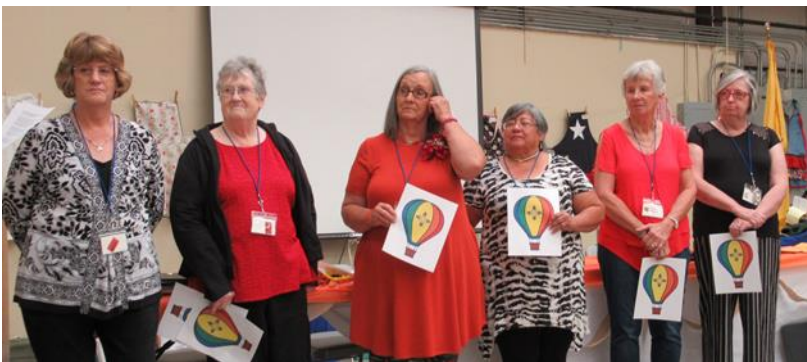
2019 EANM Executive Board Installed