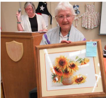
Best of Show and People's Choice Winners