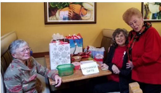
Celebrating Christmas with a Couple's Party at Little Anita's Restaurant