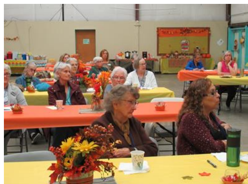
Attending the meeting And enjoying the Beautiful decorations