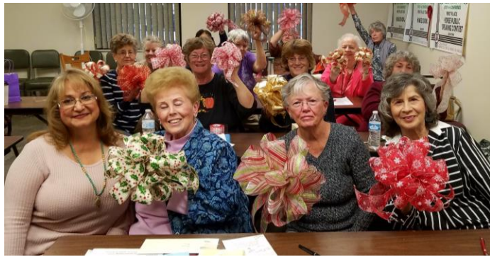
Showing off Christmas Bows that Bessie of Bessie's Lace & Trims taught at November meeting – Beautiful!